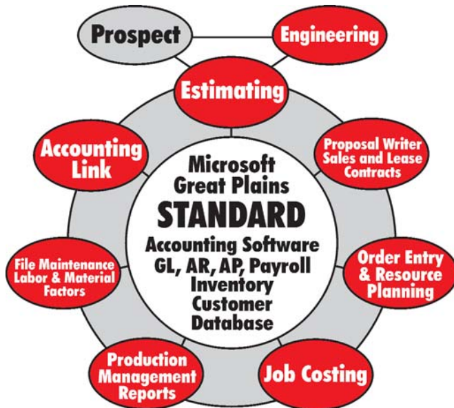
Diagram of the Fully Integrated Accutrack™ Business Control Software

The Estimating and Engineering Modules, both available as stand-alone programs, provide fast and accurate engineering and pricing for the vast variety of custom built products you produce. The Estimating Module incorporates over fifty years of labor studies into an easy-to-use program interface. The Engineering Module calculations were recently upgraded to meet the latest Uniform Building Code.